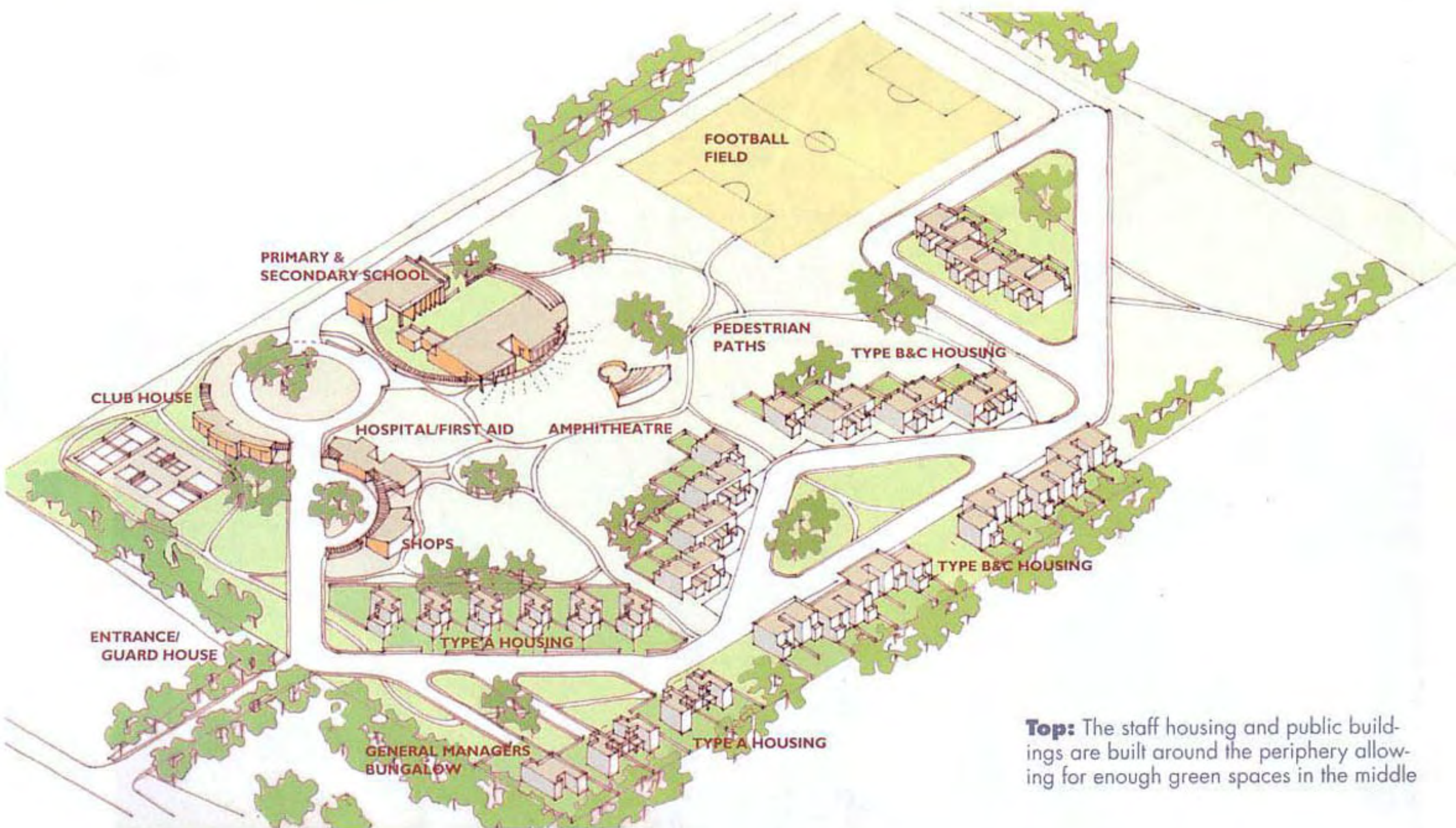
Top: The staff housing and public buildings are built around the periphery allowing for enough green spaces in the middle